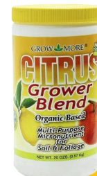
Grow More Citrus Grower Blend