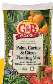
G&B Cactus Mix