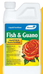
Monterey Fish & Guano