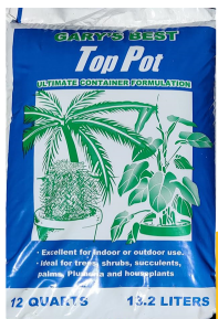
Gary's Best Top Pot