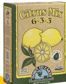
Down To Earth Citrus Mix